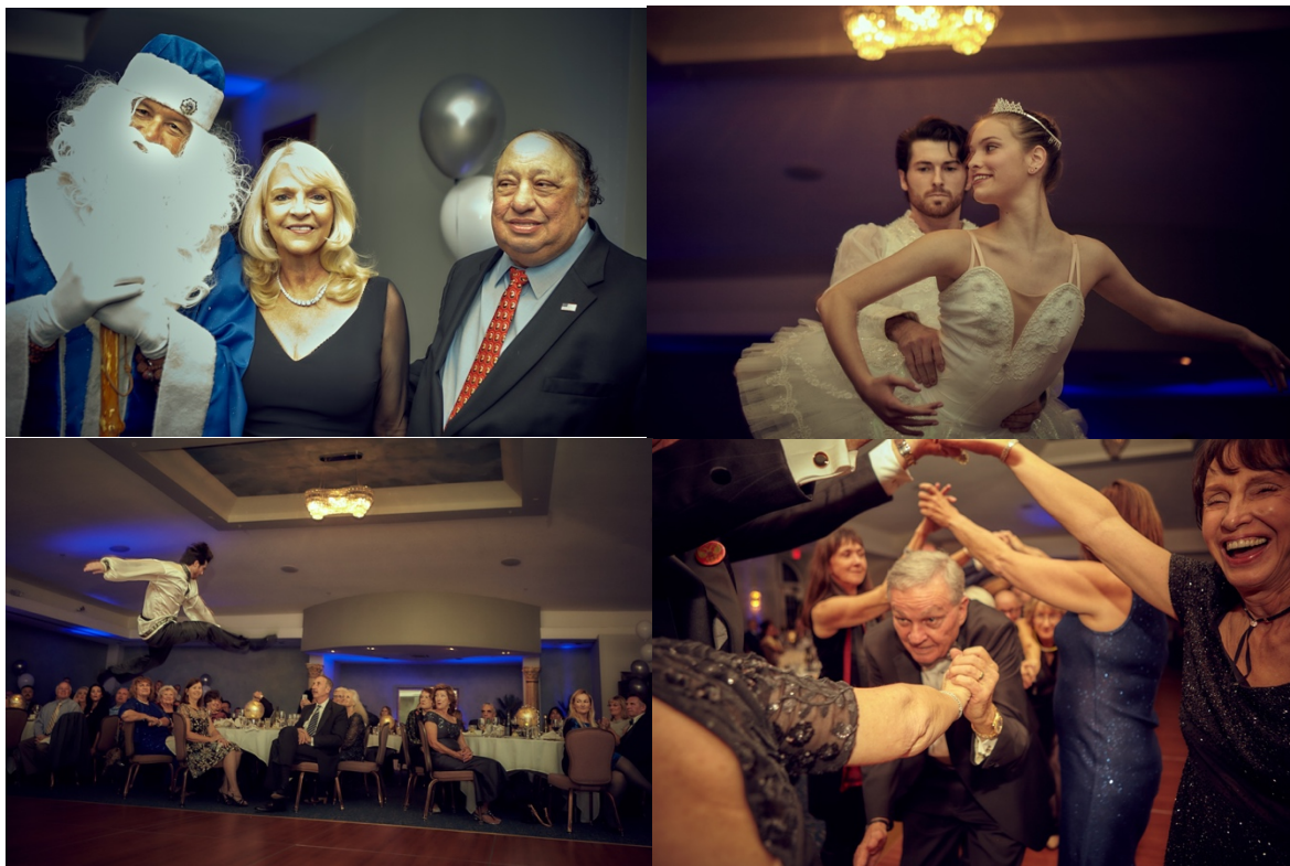
Russian Winter Ball - 2018. More photos at website and facebook page.