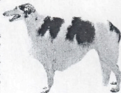
5. BORZOI БОРЗАЯ