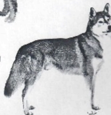
4. SIBERIAN HUSKY СИБИРСКИЙ ХАСКИ