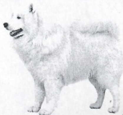
1. SAMOYED САМОЕДСКАЯ ЛАЙКА