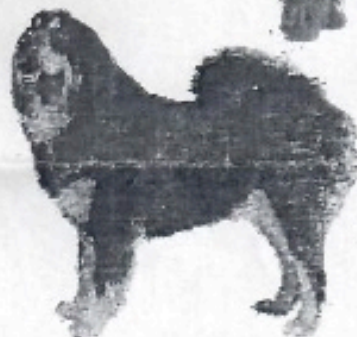
3. CAUCASIAN OVCHARKA КАВКАЗСКАЯ ОВЧАРКА