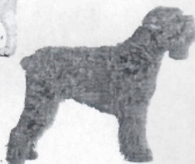
2. BLACK RUSSIAN TERRIER ЧЁРНЫЙ ТЕРЬЕР