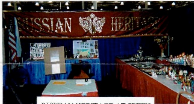
RUSSIAN HERITAGE AT SPIFFS