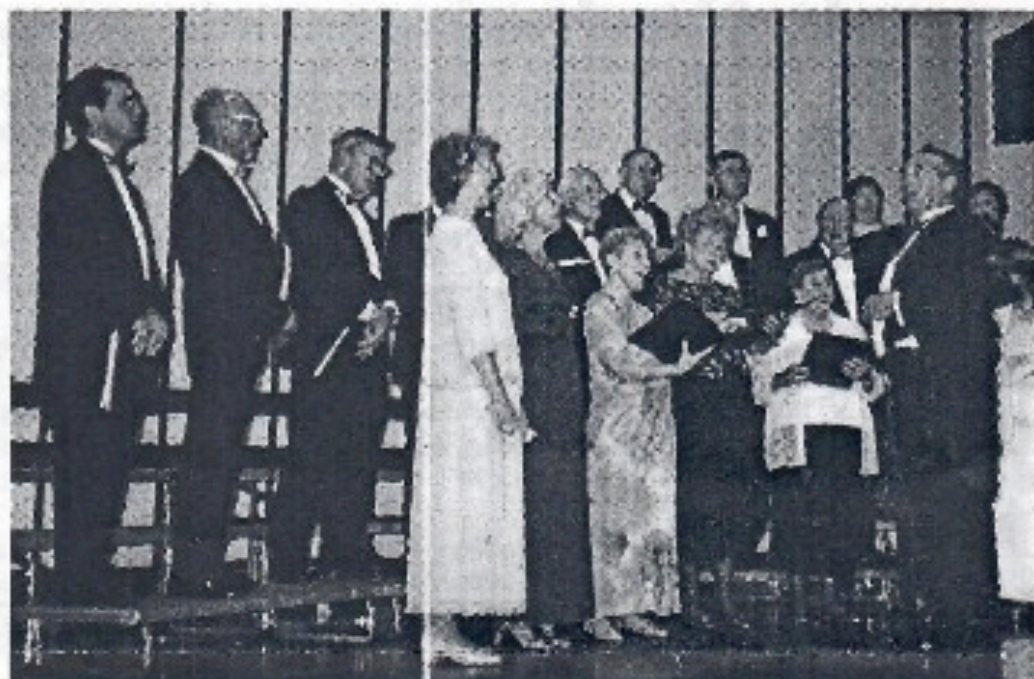
The Florida Slavonic Choir in Concert at USF in Tampa.